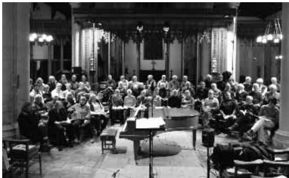
Photograph taken during a break in the recording session at Orford Church on 1 December 2015. Aldeburgh Music Club was featured on BBC Radio 3 'The Choir' programme broadcast on Sunday 3 April 2016. The broadcast included excerpts from the recording session.

The lists of performers were correct at the time of going to press