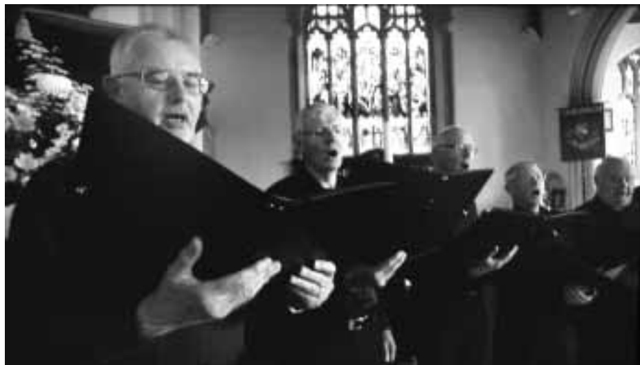
Members of Aldeburgh Music Club performing Britten's Curlw River on the BBC Countryfile programme