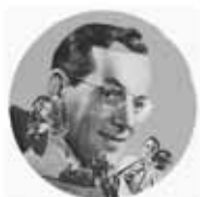
Get 'In The Mood' at Snape Proms