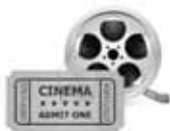
A film at Aldeburgh Cinema