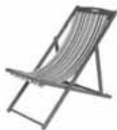
Relax with Suffolk Cottage Holidays!

There's an endless list of great things to do in Suffolk. But you need an ideal base to get the most from your visit.