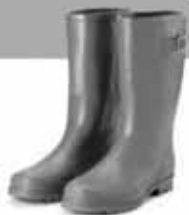
The Literary Arena at Latitude Festival