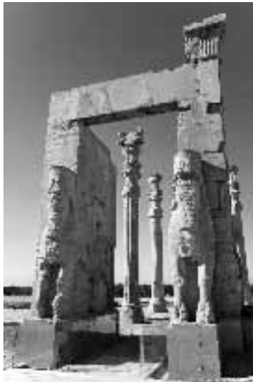
Gates of the Nations Persepolis, Iran

Your voices tune, and raise them high, till th'echo from the vaulted sky the blest Cecilia's name; Music to heav'n and her we owe, the greatest blessing that's below; Sound loudly then her fame. Let's imitate her notes above; and may this evening ever prove, sacred to harmony and love.