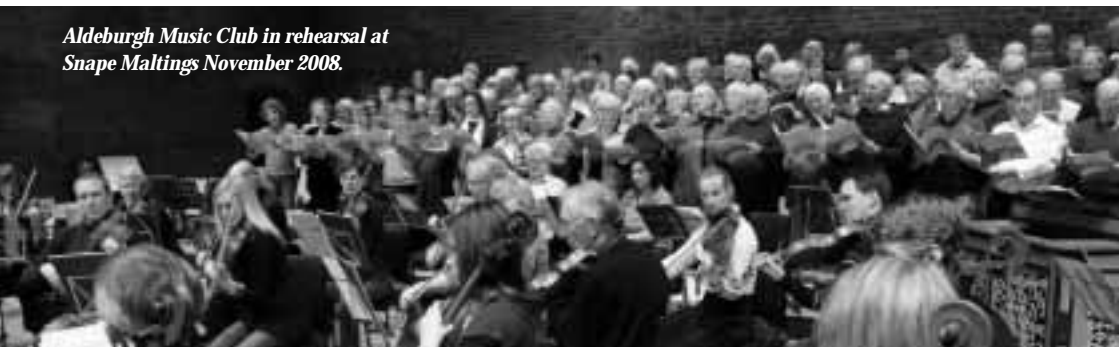
Aldeburgh Music Club in rehearsal at Snape Maltings November 2008.